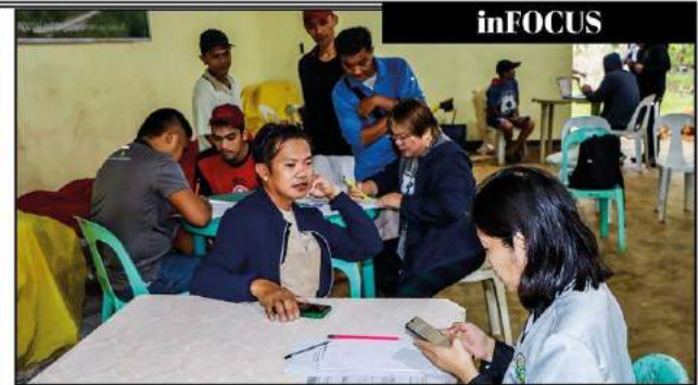
TOP: The PRDP RAEB Team conduct the Key Informant Interview using the mobile RAEB tool. BOTTOM: The mobile version of the RAEB tool makes it easier for the team to conduct interviews and assessments in the field.

The Lauen - Tud-ol FMR is a 9.82-kilometer farm-to-market road that traverses the barangays of Tungao and San Mateo. Completed in 2022, it aims to complement the enterprise subproject in connecting the