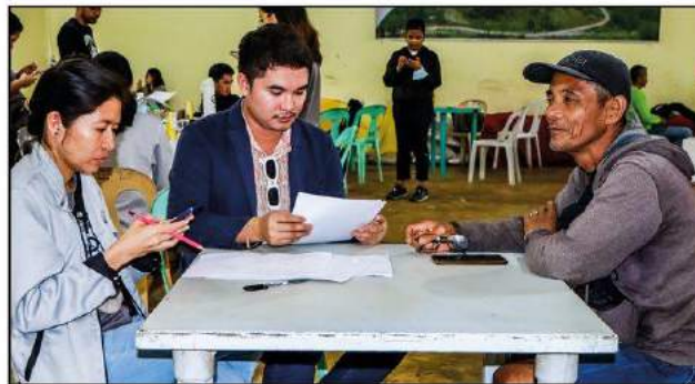
The FRDP RAEB Team interview a farmer member of the Kln.7 Farmers' Producers Cooperative (KFPC) to assess the impact of the rubber enterprise subproject to their community.

Interestingly, the cooperative attributes its success to the strategic intersection of DA-PRDP interventions. While livelihoods have