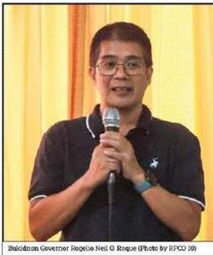
Bukidnon Governor Rogelio Neil O. Roque

"The approval of this subproject is an indication that you are compliant with the